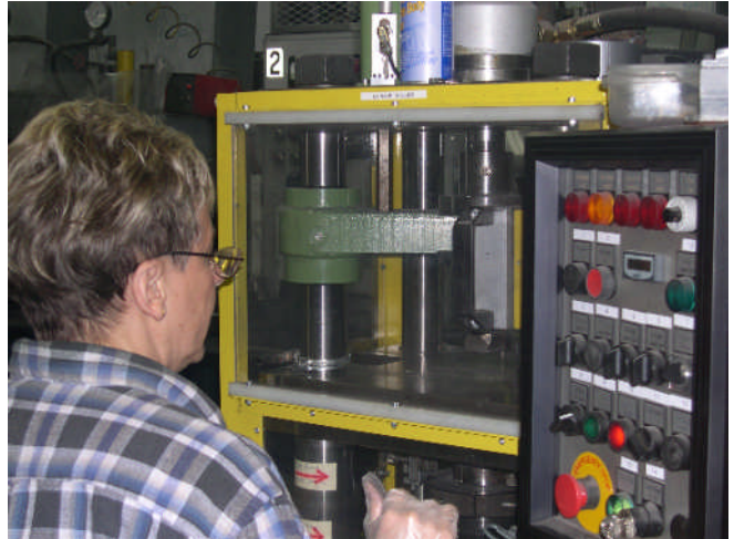
COLD PRESS SEGMENTS FOR EASE OF HANDLING