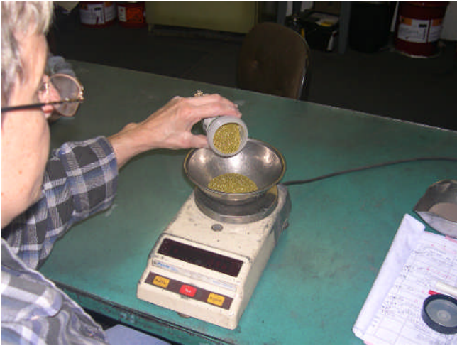
DIAMOND AND POWDER WEIGHED