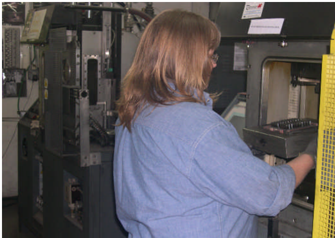
ATMOSPHERE CONTROLLED HOT PRESS OF SEGMENTS